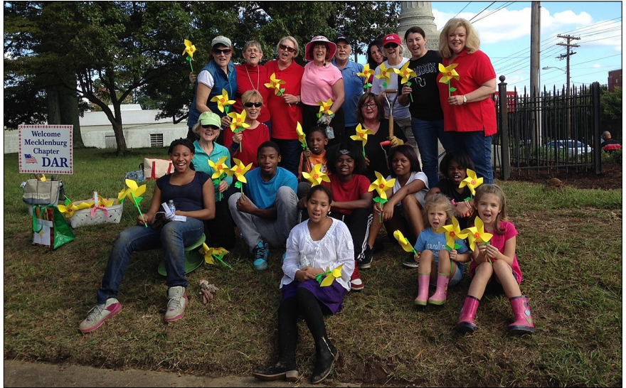
Pictured - Mecklenburg Chapter, Clear Creek Militia and the youth from Christ Presbyterian after planting 360 daffodils at the Camp Greene Monument.

October 11th was the 125th Anniversary of the Daughters of the American Revolution and all chapters throughout the nation were requested to celebrate through community service. Members from five local DAR chapters gathered on October 11th at several sites around the Mecklenburg area to plant Bulbs from the Daffodil Project (a nonprofit organization dedicated to keeping alive the memory of children who died in the Holocaust). Members of Mecklenburg, Piedmont Patriots, Halifax, Clear Creek Militia and Alexandriana DAR Chapters worked at Marshall Park, the Charlotte Museum of History, the Camp Greene Monument and a veteran's monument in Mooresville.