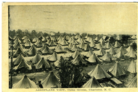
A Documentary by Jack Dillard

As we acknowledge the Centennial of World War I, Jack Dillard will show the documentary film he wrote and produced for WTVI. It tells the story of an important but somewhat overlooked chapter in Charlotte's history. During World War I, Charlotte was selected as one of 32 training camps to prepare troops for the war in France. Camp Greene was built in 90 days on 2,400 acres near uptown Charlotte. The camp later expanded to nearly 6,000 acres. More than 100,000 soldiers from across the country received training at Camp Greene in 1917/1918.