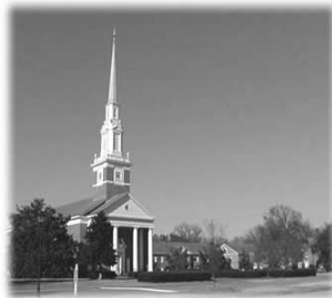
The MHA meets in Trinity Presbyterian Church's Fellowship Hall.