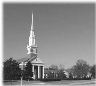
The MHA meets in Trinity Presbyterian Church's Fellowship Hall. 3115 Providence Road